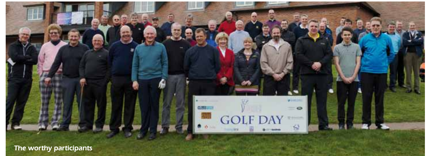
The worthy participants