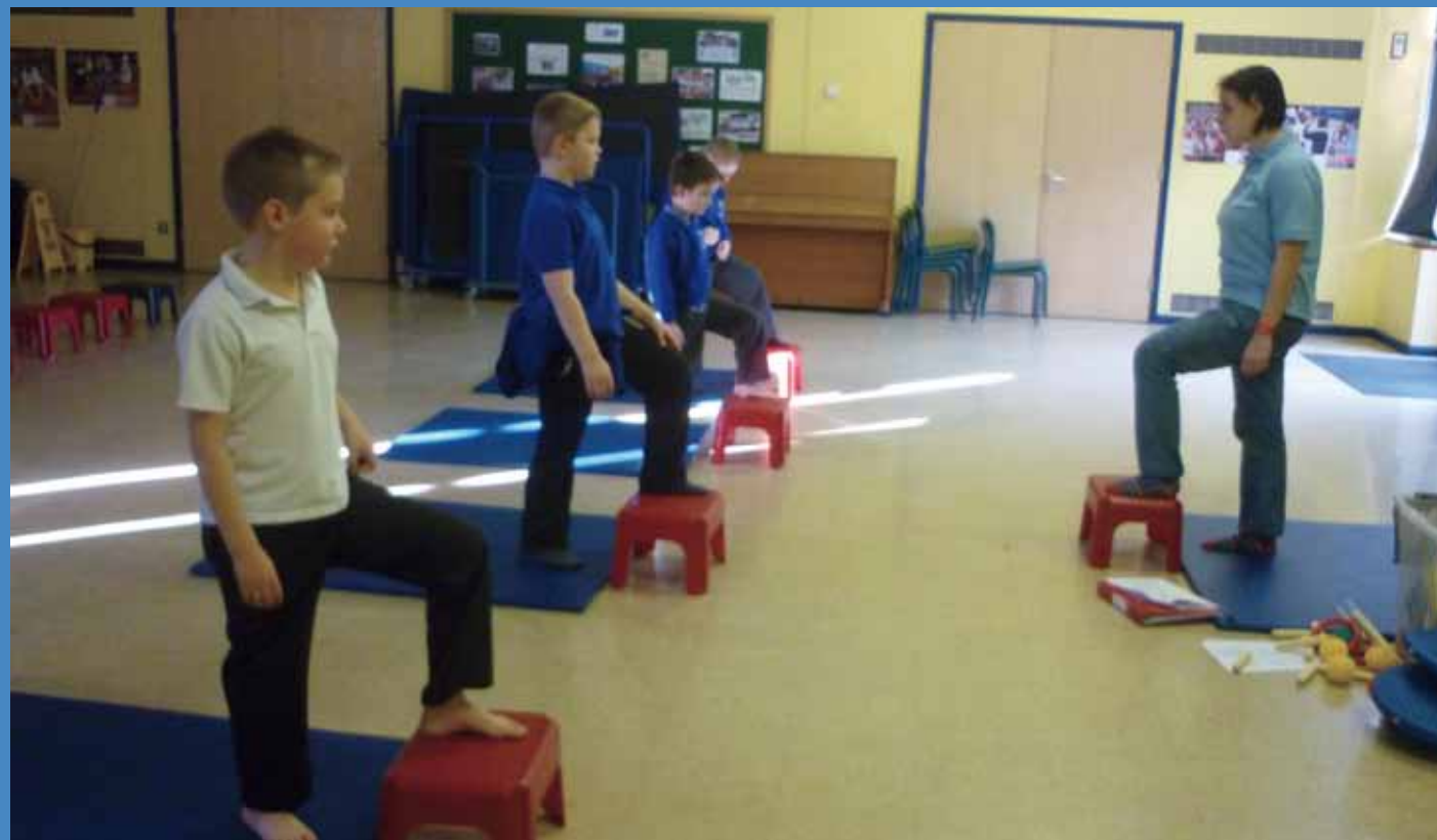
St Richard's Group